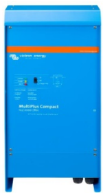
MultiPlus Compact 12/2000/80

When connected to the Ethernet, systems with a Color Control panel can be accessed remotely and settings can be changed.